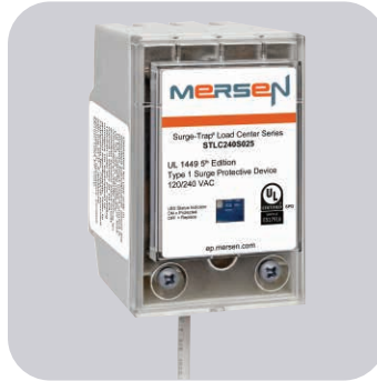
Dimensions (in Inches)

Mersen's STLC surge protective device adds a critical layer of surge protection to the entire home. This simple whole house solution is installed directly in the electrical panel and has flexibility to fit in a variety of different load center manufacturers and models. The STLC Series satisfies the new 2020 NEC Article 230.67 requirement for surge protection for residential dwellings.